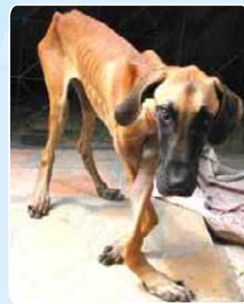
Pet cruelty is very rampant