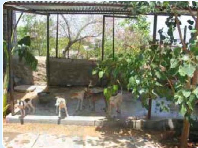
New skin treatment ward