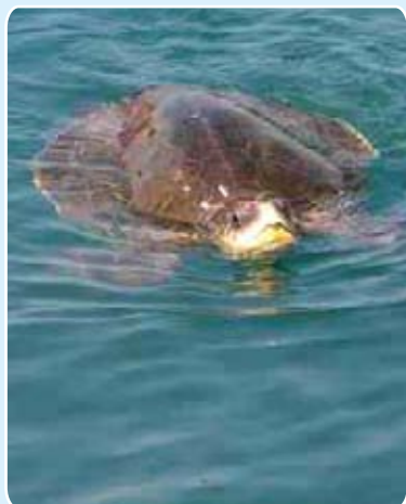
Olive Ridley turtles get help

Important days including the annual Big Adoption Day on the first weekend of May were celebrated along with camps and Awareness talks. The national Animal Welfare fortnight was celebrated from Jan 15th to 31st, 2007. Thanks to good planning and execution we were able to help 7667 animals during the fortnight! On 20th Jan a Sterilization programme was started in Devi area, Orissa to bring down the number of the dogs the prey on the turtle nests. A project was started along with Green Life Rural Association, Orissa to protect the nests and enrich the environment at the turtle nesting grounds.