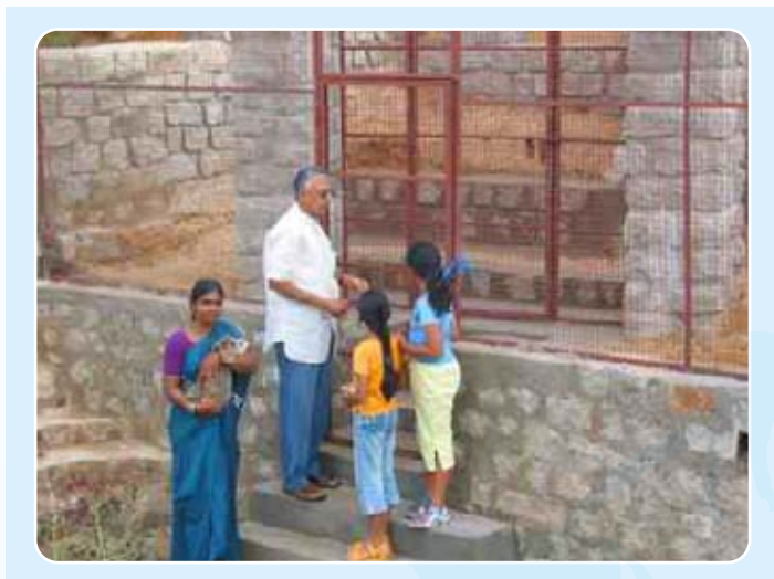
New 'Happy Cat' Shelter