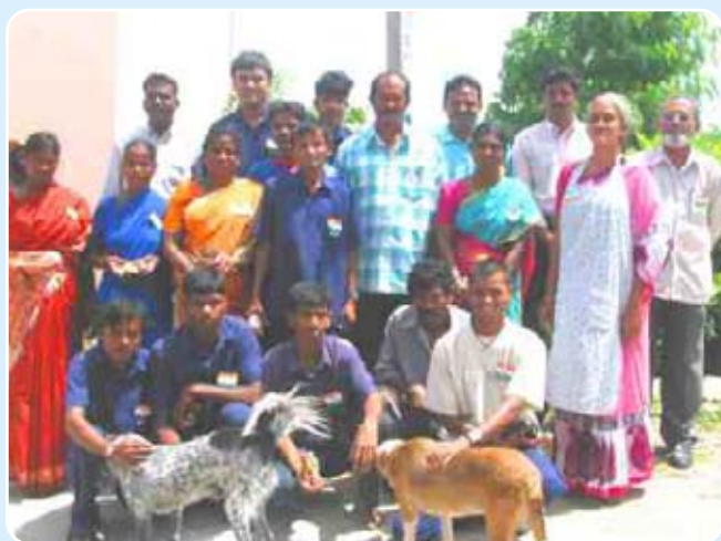
Shelter Staff & residents