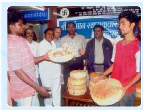
Snakes rescued on Nagpanchami