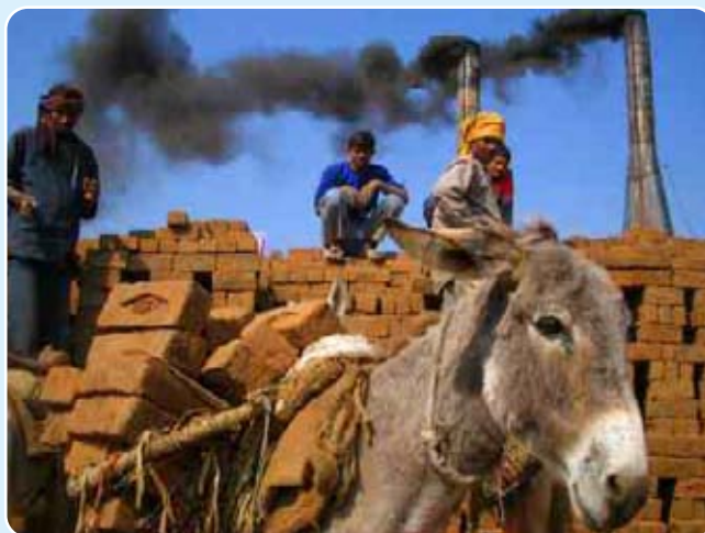
Working Animals get help

Entering the sixth year with renewed enthusiasm, reaching out to as many communities depending on Equines for their livelihood, the team spreads it's work up to Kurnool, Mahaboobnagar & Anantapur and in Tamilnadu & Maharashtra as well. Teamwork is through continuous interaction with owners and handlers to bring in responsible ownership and veterinary intervention.