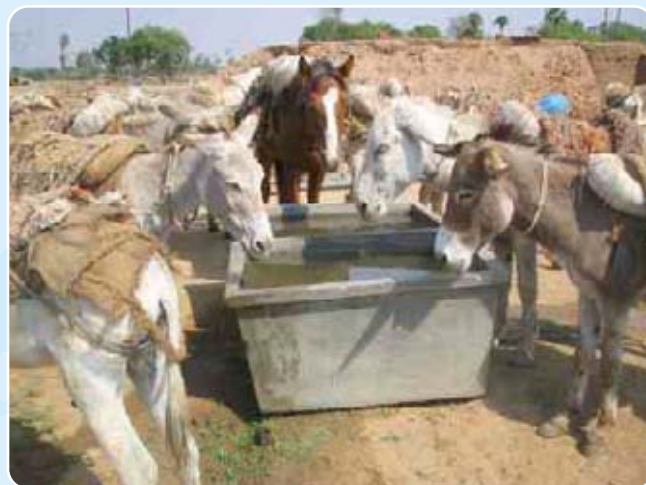
Water troughs make a huge difference at work