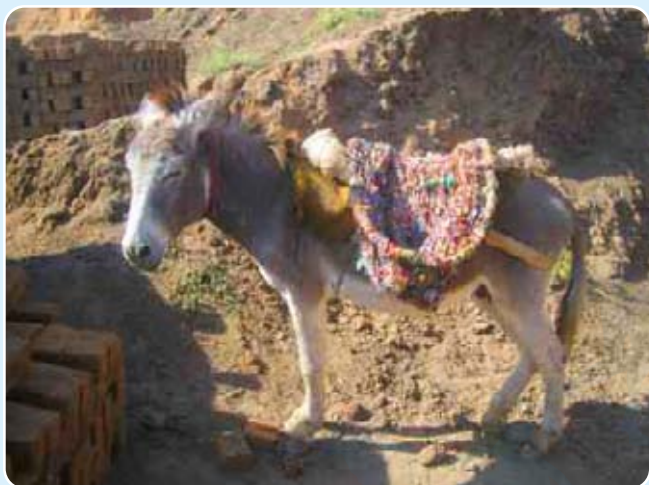
Brick kiln donkey gets relief